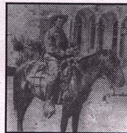
Benjamin H. Crayton with one of his trusty steeds.

In a ritual older than the first settlers, every spring the Crayton brothers, Billy [Baylor] and Bruce, hitch up their mules and plow the land they own beside Bishop Road. Billy is 81 years old and Bruce is 83, but they show no sign of slowing down in determination to continue farming by traditional methods.