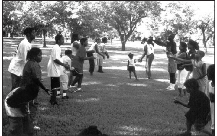
Ballon toss just one of the outdoor activities the family enjoyed last year at Crayton Reunion 2003.

Max Starke Park in the largest park in Seguin, equipped with basketball facilities, a playscape for kids, a covered